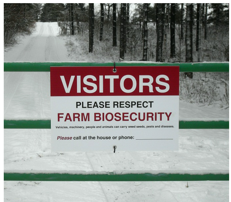
Figure 4. Example of farm gate communication with visitors. Include a phone number at which potential visitors could request entry.

People do not need to access all your property. Use gates—even temporary ones—to control access and foot traffic. Permanent locking gates in key areas help with overall farm security and are a good investment that helps prevent theft and damage. Figure 4 is an example of effective use of a gate with good signage.