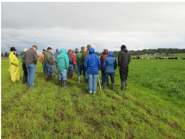
Figure 7. These farm tour participants are learning about pasture and beef cattle management. This was an effective educational event despite no direct contact with livestock. Participants wore appropriate footwear and cattle will not return to this area for weeks.

It is difficult to disinfect baby strollers, chairs, and wheelchairs properly, so discourage their use. Young children should walk, be carried, or left home. Farm-origin vehicles such as four-wheelers or golf carts can be used to transport those who need assistance. Provide chairs, lawn area, or bedding bales for sitting.