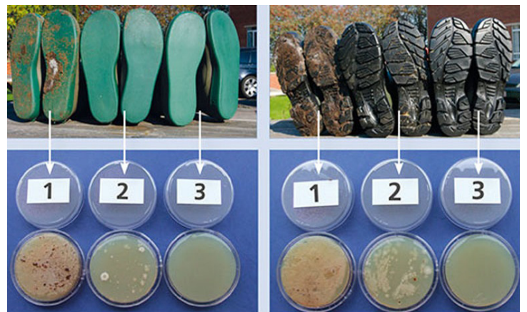
Figure 3. Demonstration of bacteria cultured from boots with smooth and patterned soles. 1 = dirty, 2 = washed with water, 3 = disinfected. Note that patterned-soled boots are more difficult to disinfect effectively and may still harbor bacteria.

It is critical for farm tour participants to wear clean clothing and disinfected footwear, especially if they live on a farm themselves (Bowman and Shulaw 2001a). Anyone with soiled clothing or footwear should not be allowed access to the premises; Figure 3 depicts the bacterial loads that can be cultured from contaminated footwear. Farm footwear and clothing policies should be shared during the pre-registration process and in event promotional materials.