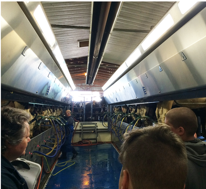
Figure 1. Farm tours such as this can educate the public about the facts of modern dairy farm operations, for example, and help dispel misperceptions, confusion, and incredible beliefs perpetuated through biased sources.

If you are interested in and willing to host a farm tour or workshop for educational purposes, THANK YOU! With only about 1% of the US population producing food (USDA 2012), the general public and beginning farmers have limited opportunities to learn about farm management practices firsthand. Educating the public about best agricultural practices helps strengthen connections between farmers and consumers, dispel misinformation, and cultivate the next generation of farmers (Figure 1). Furthermore, a farm tour can be an excellent marketing tool by facilitating exposure to potential customers. Farm tours are also popular with “backyard” producer groups and clubs that enjoy traveling to each other’s farms to share and learn from each other.