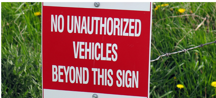
Figure 2. Clear signage posted at key locations will help control traffic and reduce risks.

Post large, legible, waterproof signs that instruct participants where to park, where to go, and what to do. REGISTRATION, PARKING, THIS WAY, and EXIT are just a few suggestions that will help direct and control traffic and behavior. An