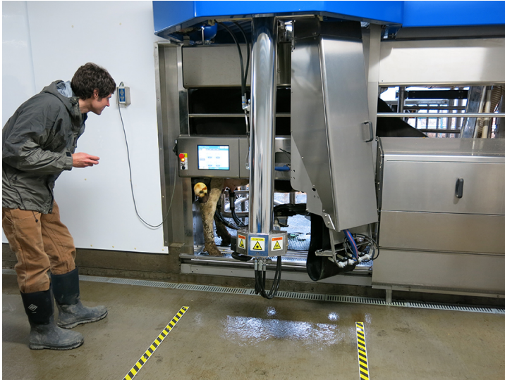
Figure 5. Thanks to close supervision and clear delineation of danger area, this robotic dairy tour attendee can get a close look at the system without risk from cattle or equipment.

Do not permit visitors access to high-risk areas with working machinery, mature intact male animals, female livestock with offspring, guardian dogs, barbed or electric wire, grain bins, manure lagoons, gravel pits, etc. (Figure 5). Do not allow strollers, pacifiers, eating, smoking, or drinking in livestock areas. If children are allowed on the tour, be sure parents supervise them at all times – this may require handholding.